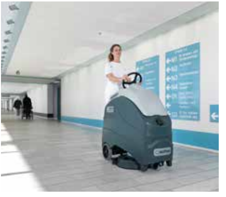
Low noise levels allow for daytime cleaning in sensitive areas such as schools, hospitals, etc.