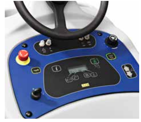
The intuitive dashboard, one touch button and userfriendly menu for operation settings make SC1500 easy to operate even for beginners