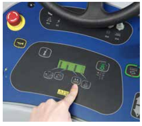
A small footprint and yet 51 cm scrubbing power combine performance with easy maneuvering