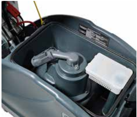
44 liter tank, allows cleaning up to 75 minutes per tank