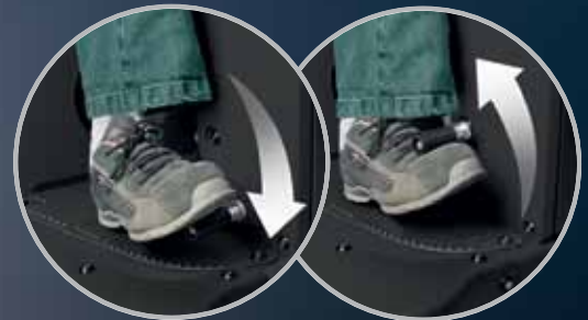
Pedal controls for forward/backward direction