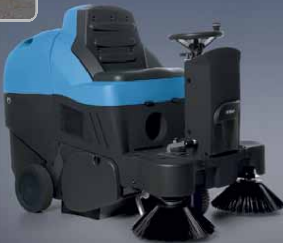
FS700 B (Basic)