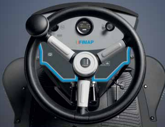
Instrument panel (Basic H version)

The brushes (central and side) are easily moved with the aid of 2 levers