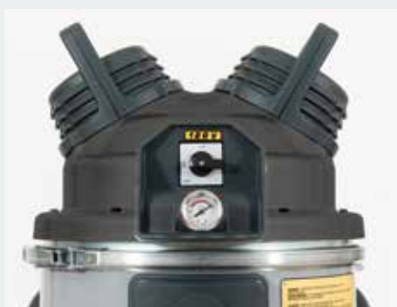
Vacuometer to monitor constantly the vacuum cleaner performances