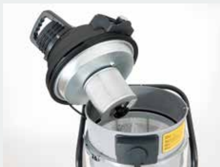
Star filter and absolute filter