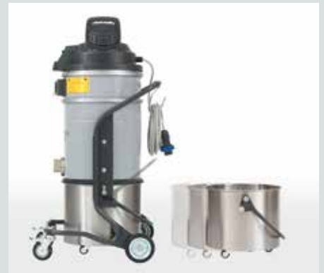
Practical container release system