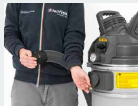
PullClean filter cleaning system: close the inlet and pull the flap rapidly and several times