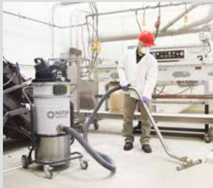
Cleaning of the production area to secure the highest level of hygiene