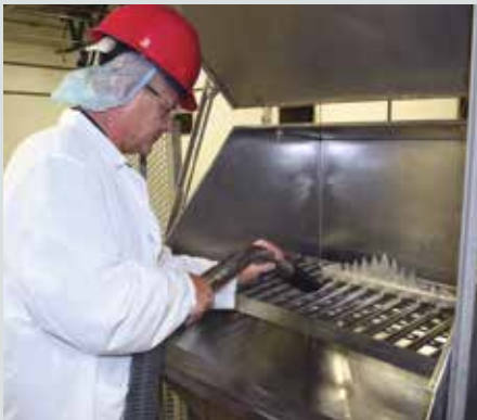
Ideal to clean the processing machine at the end of the working cycle