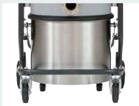
Stainless steel 37L container