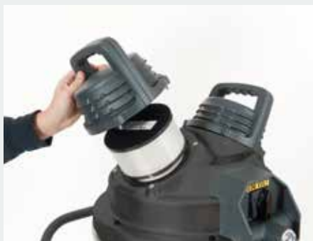
Absolute filtration for the cooling air