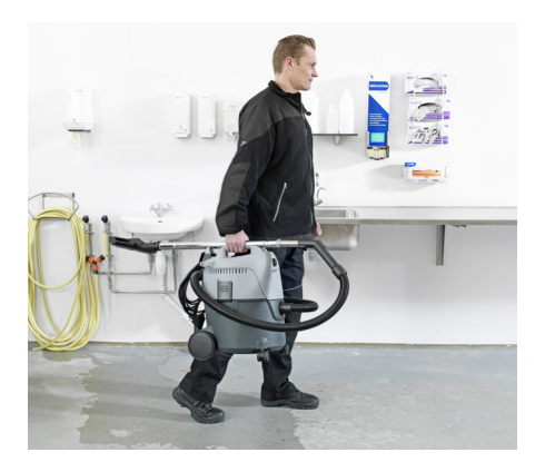
VL200: Compact and ergonomic design for easy transportation