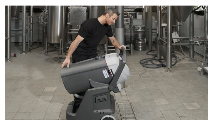
Easy and fast emptying of the VL500 container thanks to the unique Ergo Tipping system. Emptying the machine without having to remove the motor head makes daily cleaning easier ans safer