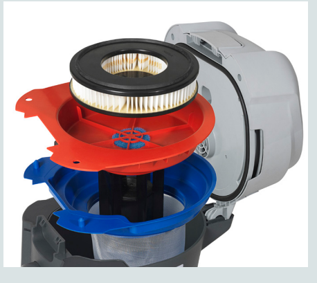
Dual filtration enables you to clean both wet and dry without changing filters