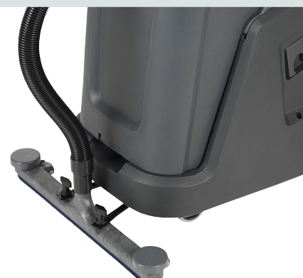
Big areas to clean? Try the squegee accessory for the VL500.