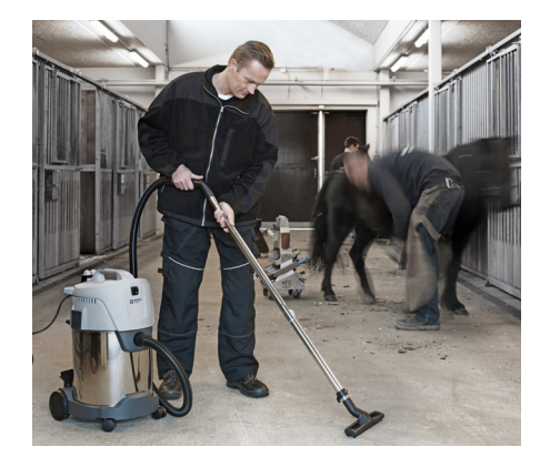
VL200: This handy machine is available with an Inox container for the extra tough environments

VL200 and VL500 are ideally suited for hotels, contract cleaners, education, exhibition and conference centers as well as public buildings, manufacturing and industrial applications.