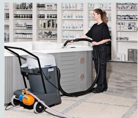
A flood pump is available as an accessory, and is the ideal solution for moving large volumes of liquid