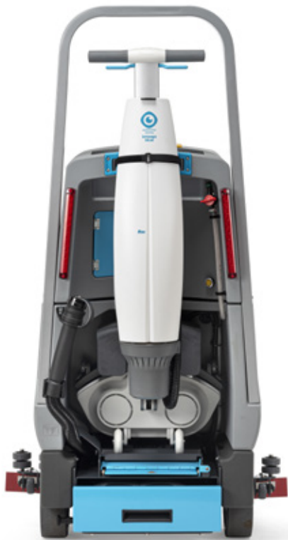
i-drive + imop Lite