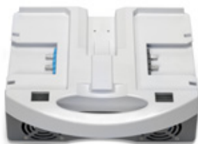
i-charge 9 (3 pieces)