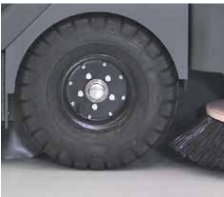
The large wheels give a smoother ride