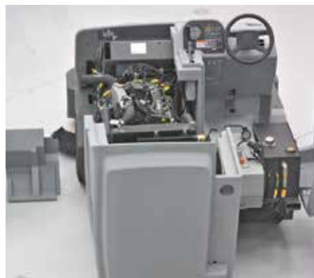
The Nilfisk NoTools™ system makes service extremely easy. The 5-sided access to engine and hydraulic components saves you valuable time and keeps down the service cost