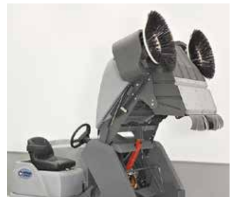
The SW8000 has a superb high-dump capability up to 152 cm from ground level for easy and convenient emptying